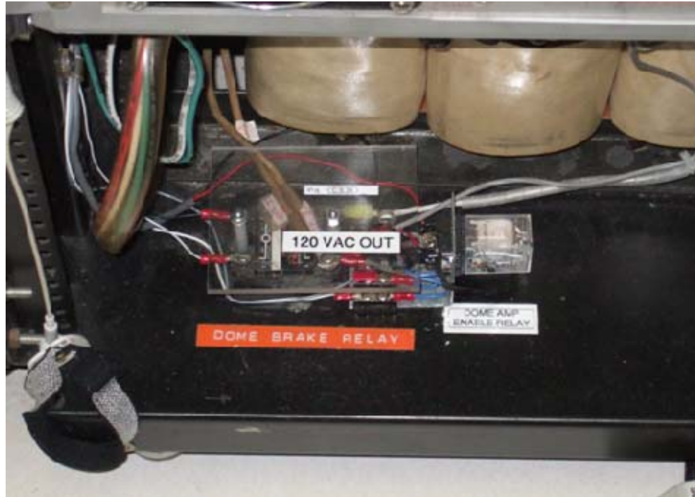
Dome Brake relay and Dome Amp Enable relay