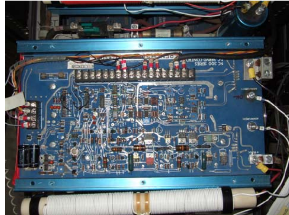
Dome East servo amp top.