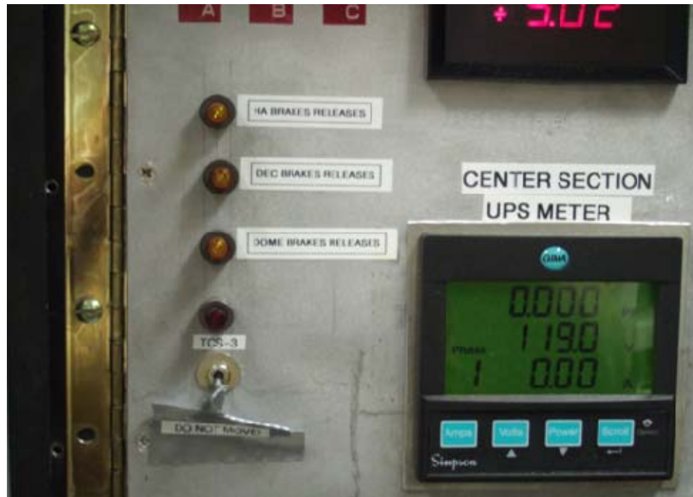
Dome Brake Release indicator lamp