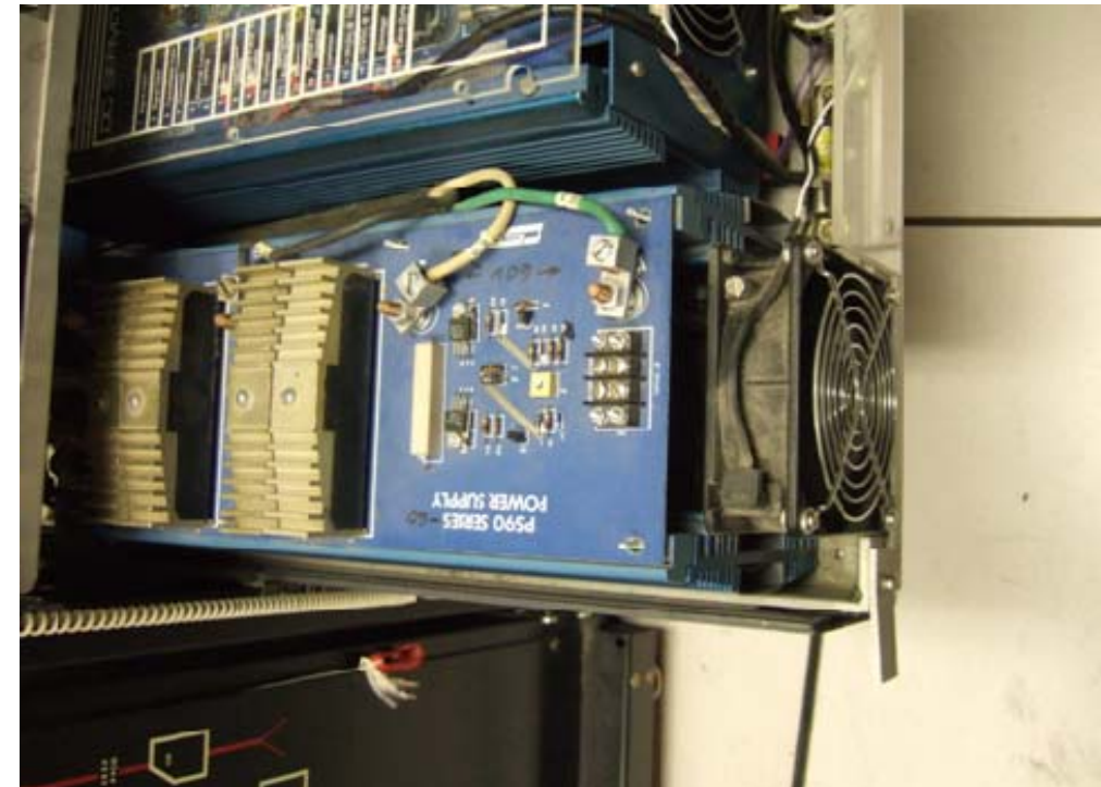
Dome amp 90vdc power supply.