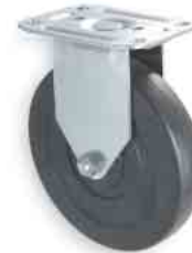
Rigid No. 1UHJ9