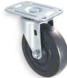
Swivel No. 1UHH5

(* ) Wheels have roller bearings. (†) NSF Certified caster. (‡) Swivel caster has 1 3/8" width wheel; rigid caster has 1 1/2" width wheel.