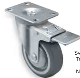
Swivel with Total-Lock Brake No. 2G039