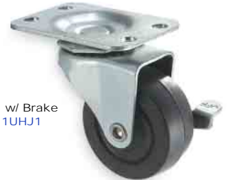
Swivel w/ Brake No. 1UJH1